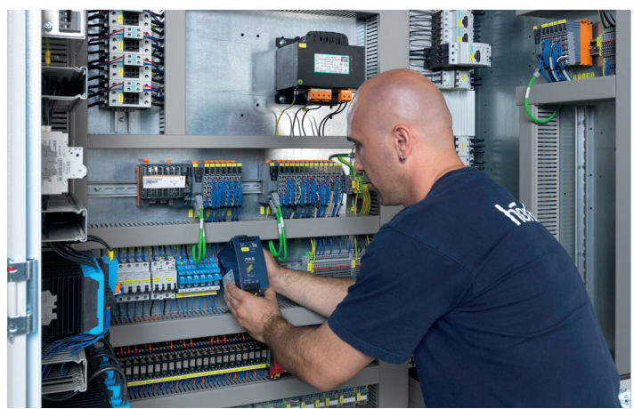
Control panel construction

Another important issue of project-specific adjustment is detailed software configuring by our experienced engineers.