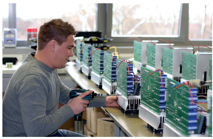
Manufacturing of electronic power supplies

Our UV lamps are supplied and controlled with electronic power supplies (EPS) made by Hönle. The use of high quality components and precise processing ensure a long service life.