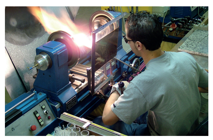
UV lamp production

Also important is the high quality of the reflectors - designed and coated by Hönle. Therefore we are equipped with an own system for coating glass and aluminum reflectors.